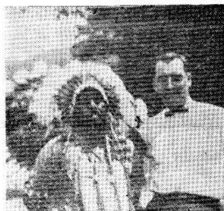
INDIAN BAPTIST DEACON AND THE EDITOR

Mission has been organized into a Baptist Church. This is one of the places of worship for the Indians on the Cherokee Indian Reservation, just east of the Great Smoky Mountains.