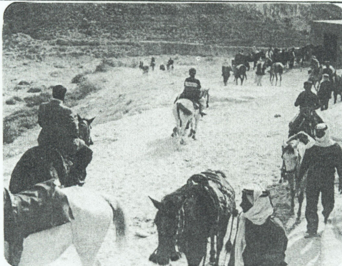
Tour group on our way to Petra in Jordan.

We were up at 5:00 A.M. at the Ambassador Hotel. We ate at 6:30 and left our hotel at 7:10 A.M. We arrived at Amman Airport. We went through