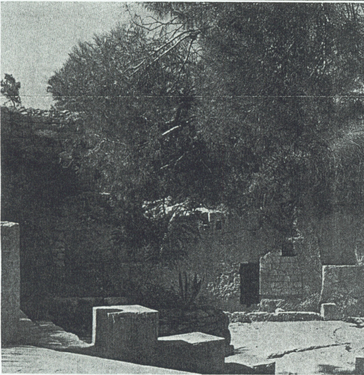
The Garden Tomb