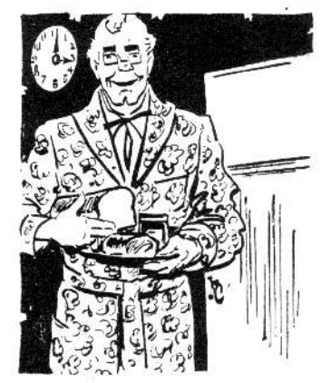
"Gossip can thrive only among folks who like to think it's true."