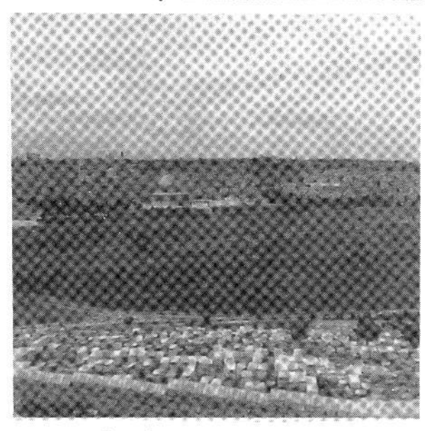
Jerusalem from Mt. of Olives