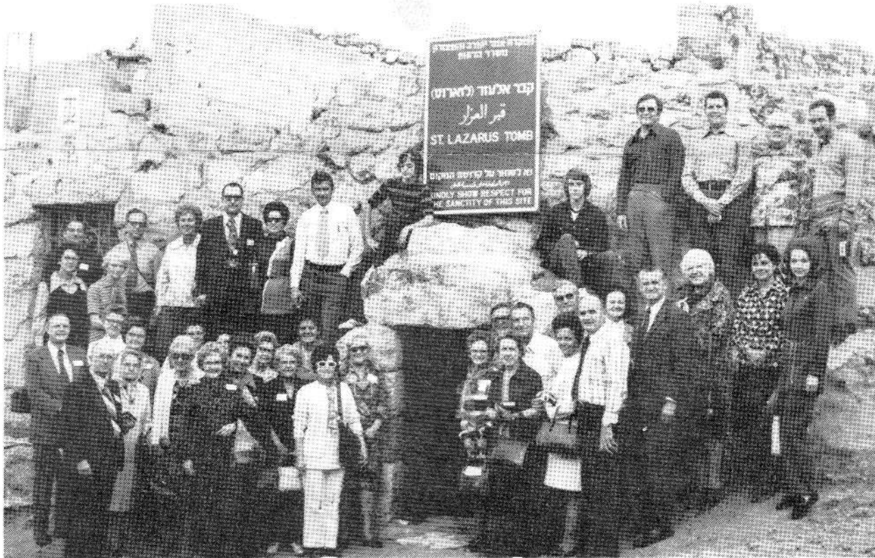
Tour group at Lazarus' Tomb at Bethany in Israel, Saturday, November 4, 1972.