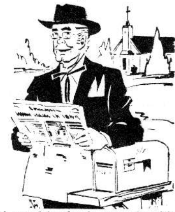
"A good leader is one who thinks he doesn't know all the answers."