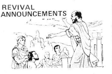
Friday - May 2

Fourth Sunday - Bethlehem Missionary Baptist Church, 1401 Lischey Ave., Nashville, Tenn. Time, 2:00 P. M.