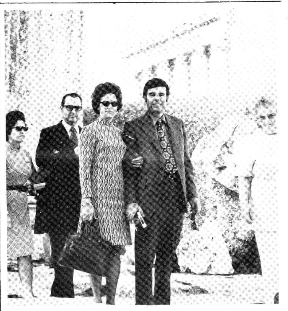
Some of tour group among ruins at Baalbek, Lebanon.

We passed through Marijat into the Bekaa Valley. Soon we reached a small village where we had a rest stop. We spent some time here in the shops and then headed for Baalbek, Lebanon, a city of many ruins. The exact date of the foundation of this city remains lost between legend and vague history. Its traditional fame may be traced back to