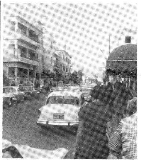
Street scene Damascus, Syria.