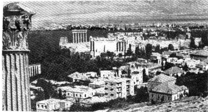
BAALBEK AND THE BEKAA VALLEY.