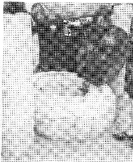
Paul's Well at Tarsus, Turkey.

From here we went to the port of Famagusta where we boarded the ship MTV Sounion which was to be our floating hotel for the next several nights. Before night we had time to go to downtown Famagusta for shopping. Returning to our ship we had supper. After eating we had a