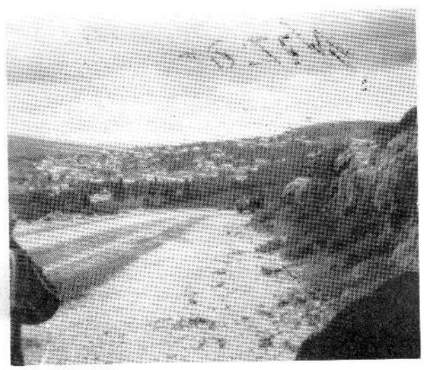
Cana of Galilee