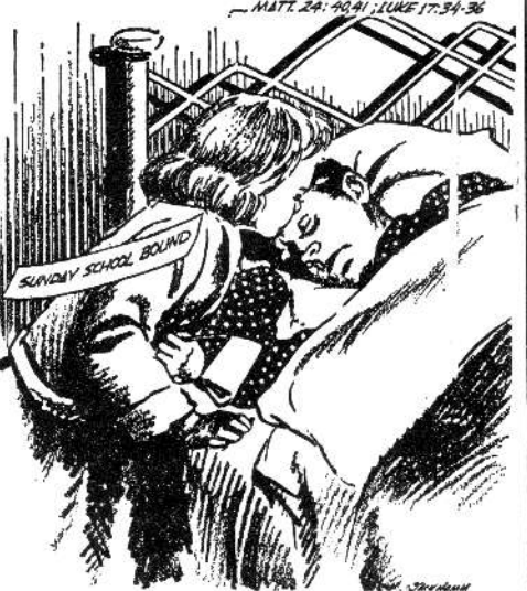
MISSIONS NEEDED IN THE HOME, TOO