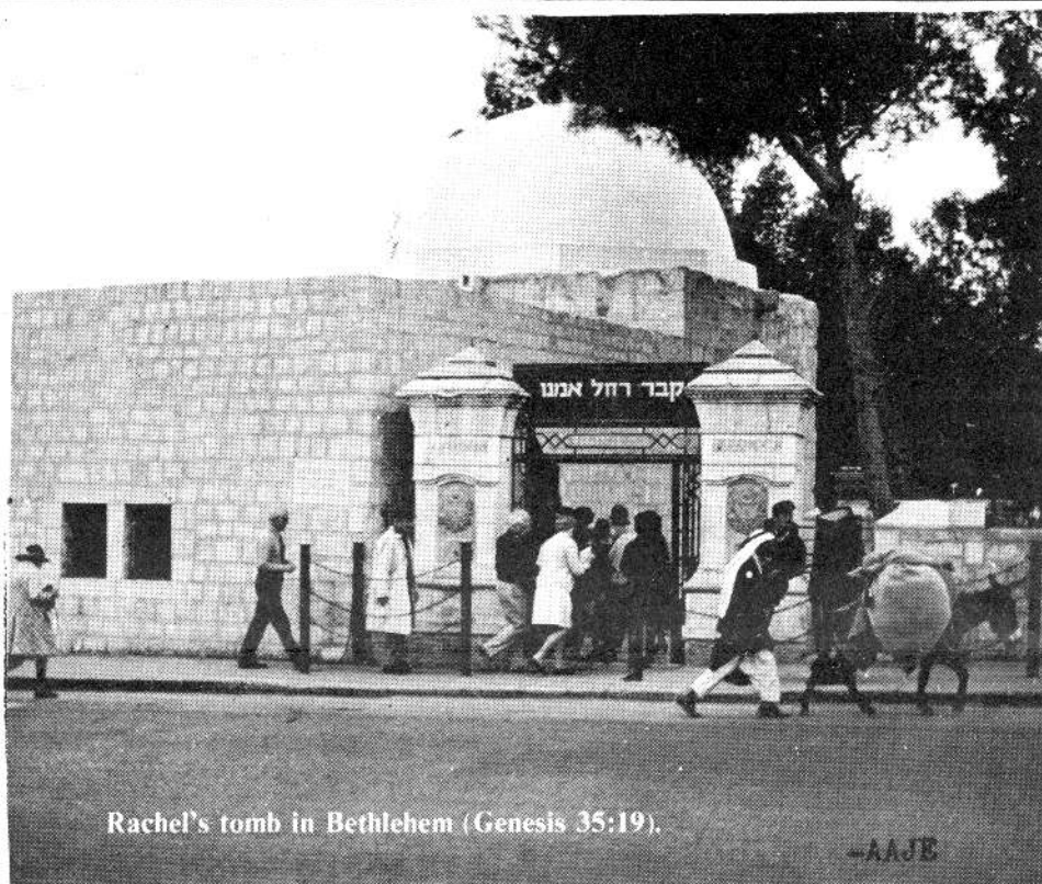
Rachel's tomb in Bethlehem (Genesis 35:19).

America is great because it is good, and if America ever ceases to be good, she will cease to be great.—Dwight D. Eisenhower