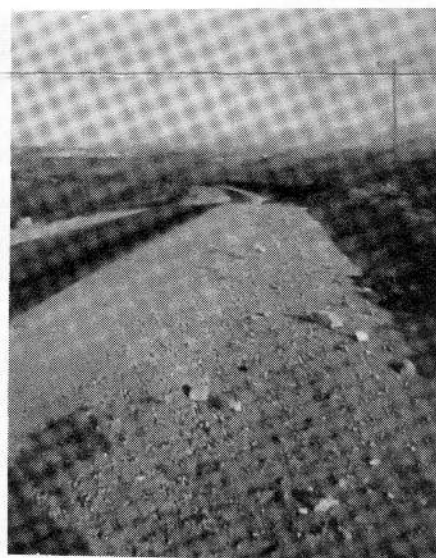
Valley of Elah where David killed Goliath.