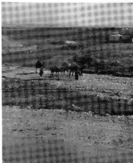
Plain near Beersheba

In the valley near Beersheba we saw some Arabs plowing in the fields with ancient made plows pulled by burros. These people are the Bedouins. We got to take a camel ride and talk with some Bedouin children.